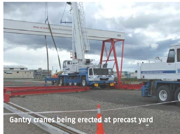
Gantry cranes being erected at precast yard