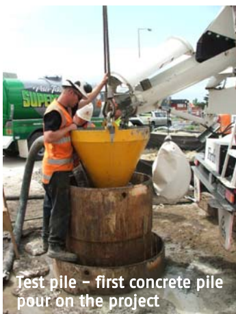
Test pile – first concrete pile pour on the project

Tree clearance and relocations on the causeway adjacent to Tauranga Bridge Marina began in preparation for road widening and access to the new Harbour Bridge east abutment; as well as along Takitimu Dr for construction of the Chapel St westbound on-ramp.