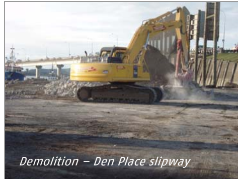
Demolition – Den Place slipway

The first piles for the temporary access platform for the new Chapel Street eastbound off-ramp were installed in late July.