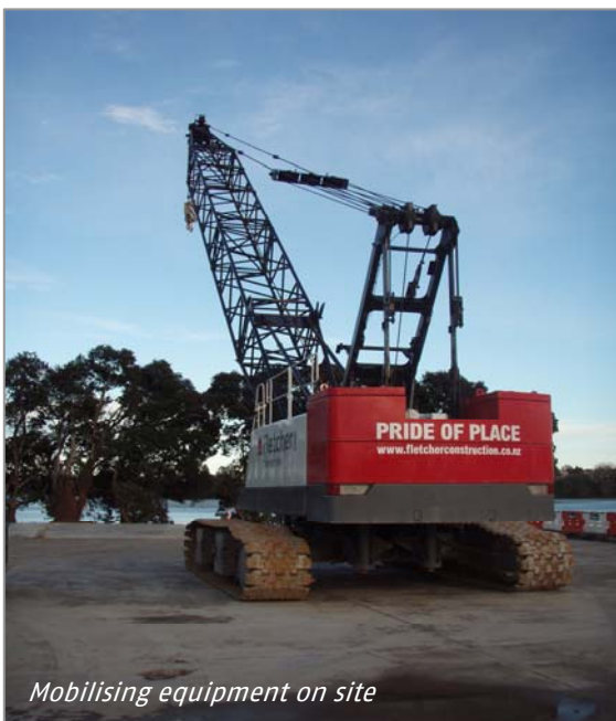
Mobilising equipment on site

Much of the work to date has been at the drawing board. Fletcher Construction's designers, URS and their partners Tonkin & Taylor and Peters and Cheung, are working with Fletcher to implement new and innovative ways to complete the project with the least impact on the community and the environment.