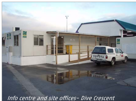
Info centre and site offices – Dive Crescent

The Project Information Centre and Fletcher Construction site offices have been established on Dive Crescent just before the roundabout. The Project Information Centre is now open Monday to Friday, from 9am to 5pm, and the staff there will be happy to answer any questions you may have about the project.